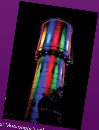
Visit Mooroopna's colourful water tower: McLennan Street