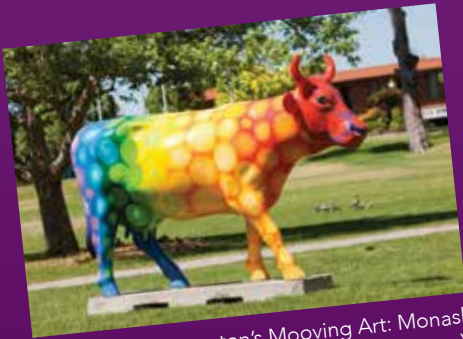
Check out Shepparton's Mooving Art: Monash Park, cnr. High & Fryers Sts