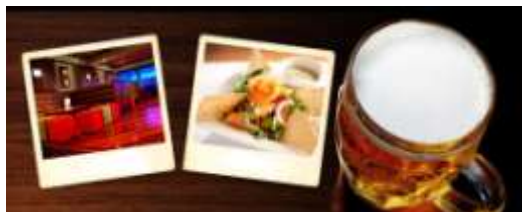
(continued in next column)

Meet your GV Pride friends for $15 steak (or another yummy dish!) @ Shepparton's GV Hotel!