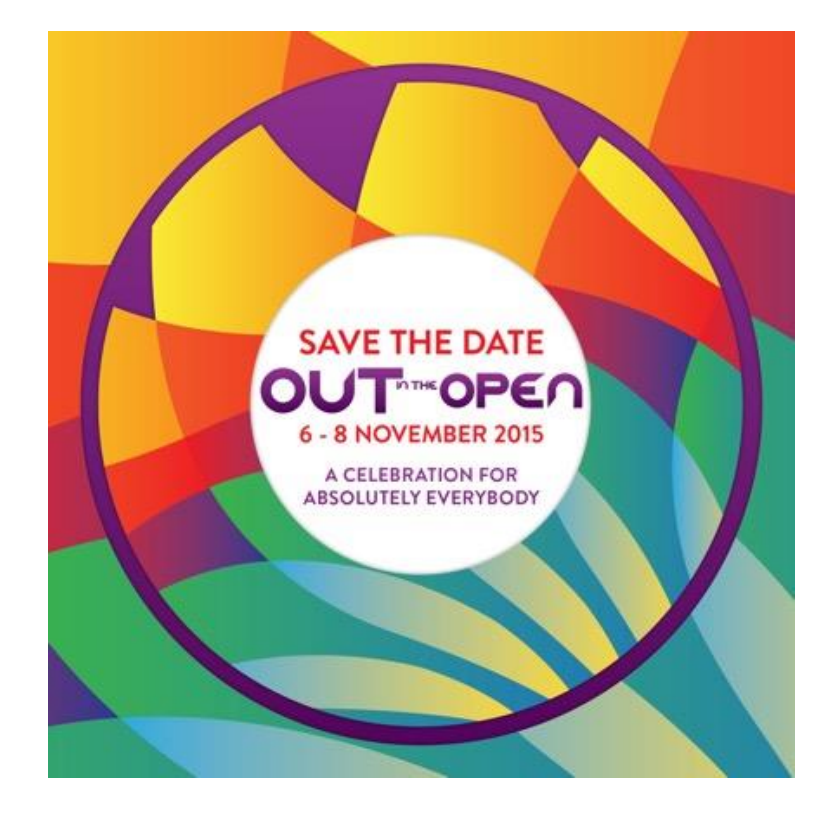
Wanna know what 'other' LGBTI festivals are happening across the country? View them all at <u>http://midsumma.org.au/festival-circuit</u>